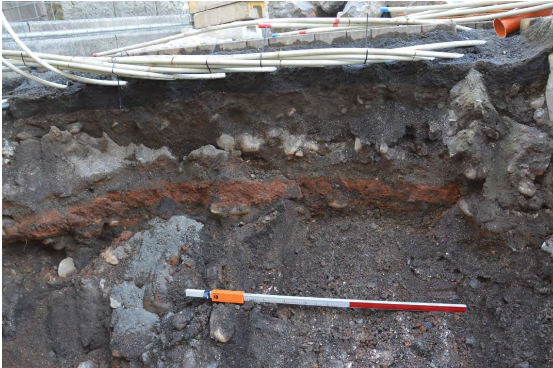
Figure 3. Close-up of the peat-ash layer in the N-NW corner of the excavated area

Scattered remains of crushed shells and, at some places decayed fish- and animal-bones, were also identified throughout the excavated area and it appears clear that their position was a result of the mentioned frequent disturbances of the site in the near past. Unidentified calcinised material (mostly crumbled and occasionally mixed with sand) was also identified in the eastern part of the area. Finally, a number of randomly positioned stone- and (fragmented) concrete blocks were identified in the eastern and southeastern part of the area.