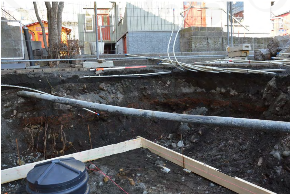
Figure 2. Peat-ash layer in the N-NW corner of the excavated area

The excavation revealed that the area was already heavily disturbed by a fairly recent development work – machine-excavation uncovered plastic-made pipes of different sizes, most likely used for water supply and/or sewer drain. Pipes (oriented differently) were positioned throughout the area, at the approximate depth of 0.3 (0.5), 1 and 1.8 m. In addition the southeastern part of the area was also heavily disturbed by tree-roots.