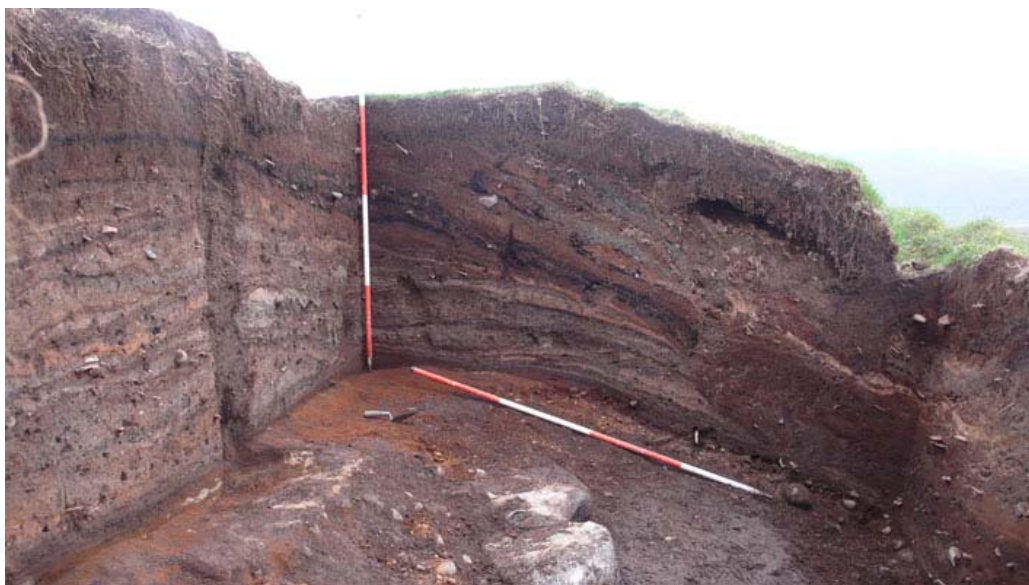
Figure 11: West section (centre) and South section (left) of the Extension unit (H15, H16, G15, H15), showing the sharply defined erosion cut in the midst of the midden deposit, running parallel to the break of slope. Note also the height of the SU 8 in the southern section at left as compared to the north (right)