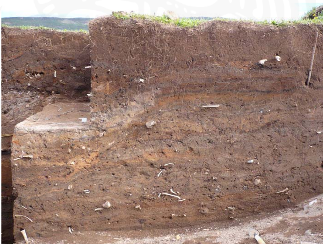
Figure 8: North Section of Main unit squares G20, G21, G22, showing step excavated into the west wall of G20 and erosional cut in upper half of the section.