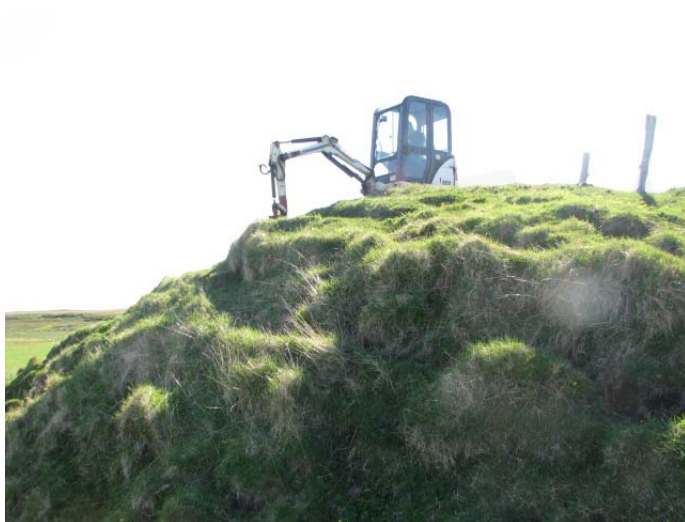
Figure 3: Re-opening of the midden excavation with bobcat