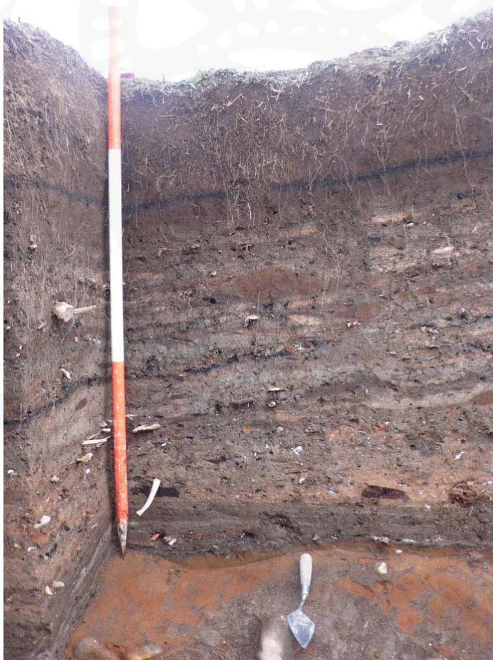
Figure 14: Southeast corner of Extension Unit (Unit H17) showing depth of midden accumulation and sharp contacts of peat ash layers, demarcated by thin lenses of darker organic rich soil horizons.