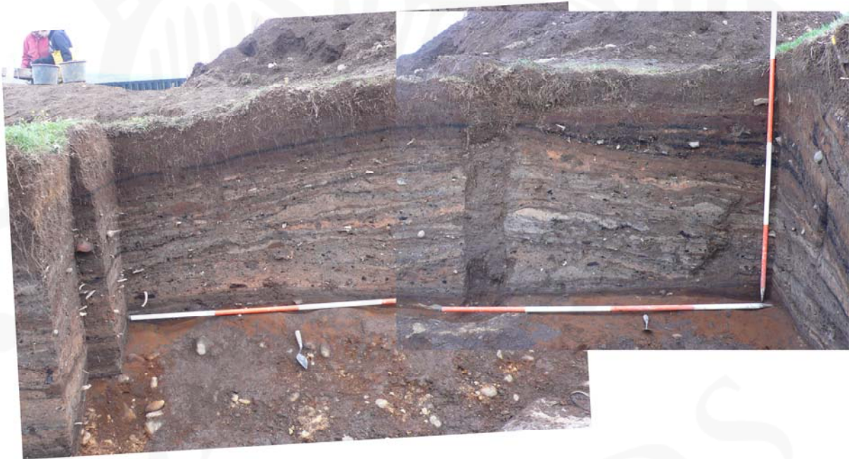
Figure 10: Photo mosaic of south section of Extension unit (H15 to H17) showing SU8 located very high in the section wall, overtop of a thick deposit of ash lenses. The 1988 archaeobotanical sampling column is seen at centre.