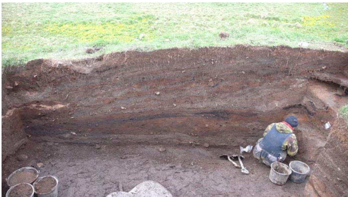
Figure 7: Uggi Aevarsson excavating in the Old/Extension unit. SU8 is clearly visible as a thick black band in the middle of the section, with post-medieval ash and turf soil layers deposited on a slant above, and turf and midden layers below.