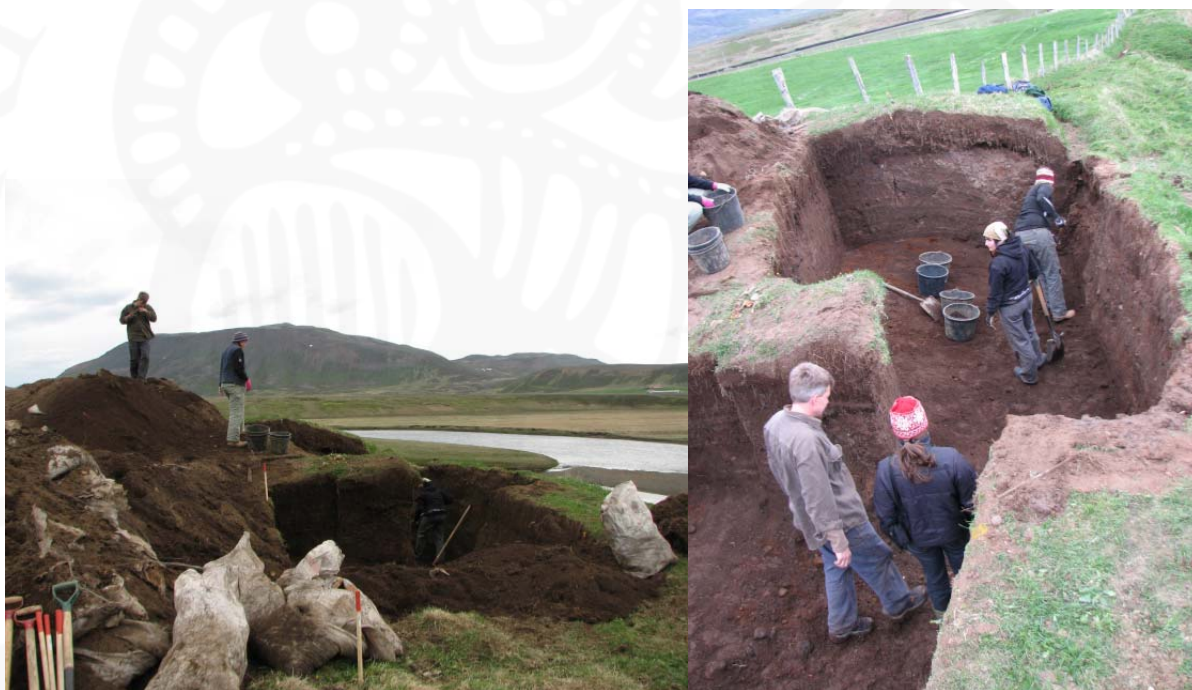
Figure 5 and 6: Cleaning of 1988 excavations