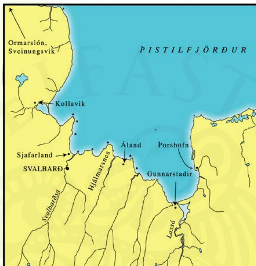
Figure __: Map of the Thistilfjordur region, northeast Iceland.