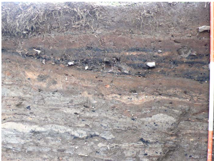
Figure 13: South section of square H15, the south-western corner of the Extension unit, showing the thickness and heterogeneity of SU8, including dense charcoal deposits mixed with red turf ash lenses.