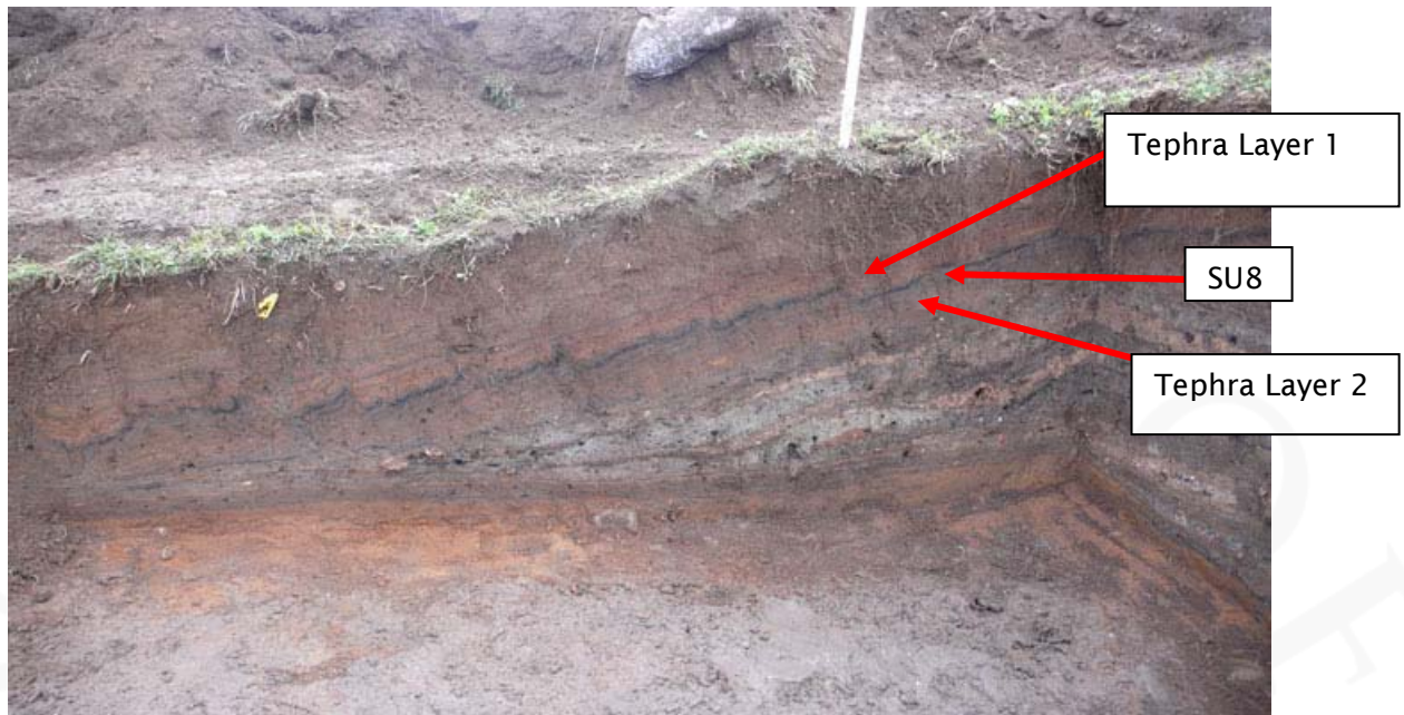
Figure 9: South Section of the Main unit, squares I20 and I21. Note the presence of cryoturbation features in AU8 and surrounding tephtras while the basal midden layers are undisturbed