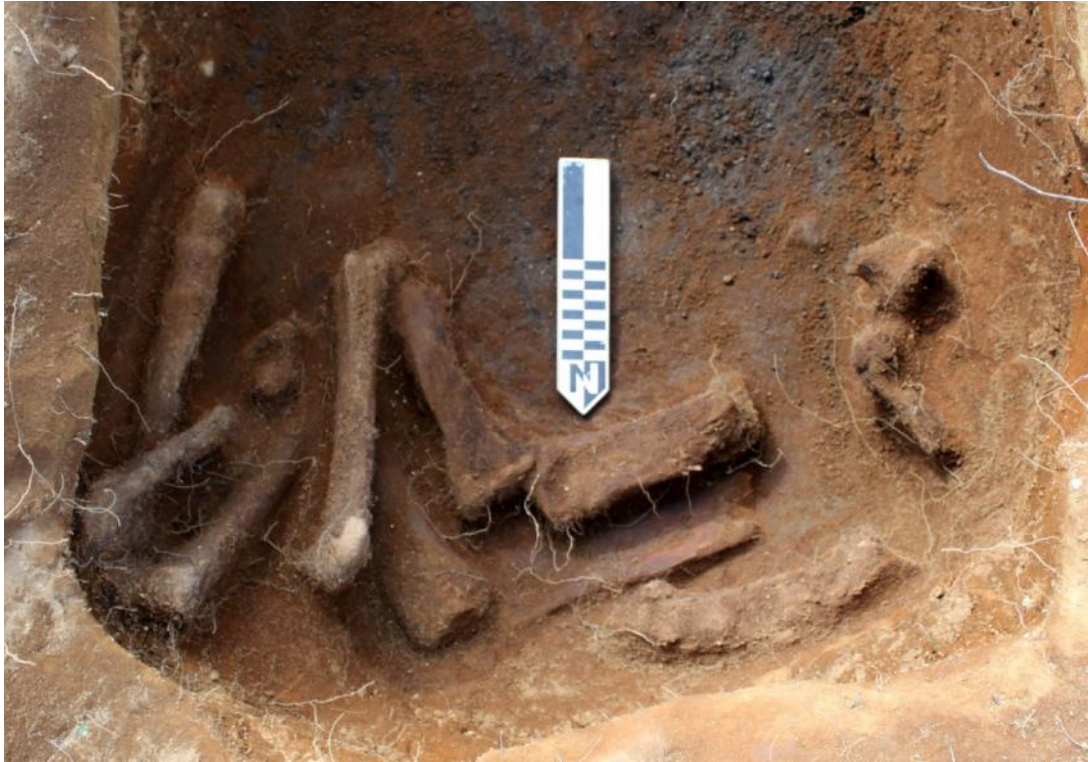
Mynd 2. Hrossbein úr nyrðri gröf.