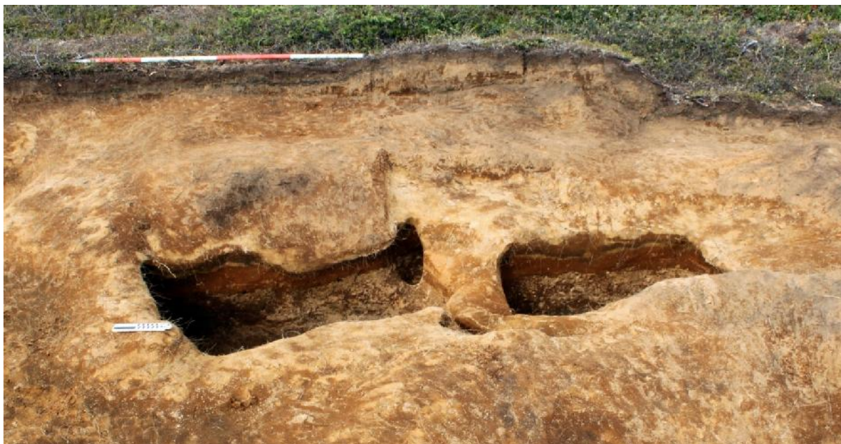
Mynd 4. Tvær grafir á svæði B, eftir uppgröft. Norður er til hægri á myndinni. Stoðarholan í norðvesturhorni syðri grafar sést vel í miðju myndarinnar.

Figure 4 - Graves in Area B after excavation. The post hole within the northwestern corner of the southern grave is clearly visible at the centre of the image. North is to the right.