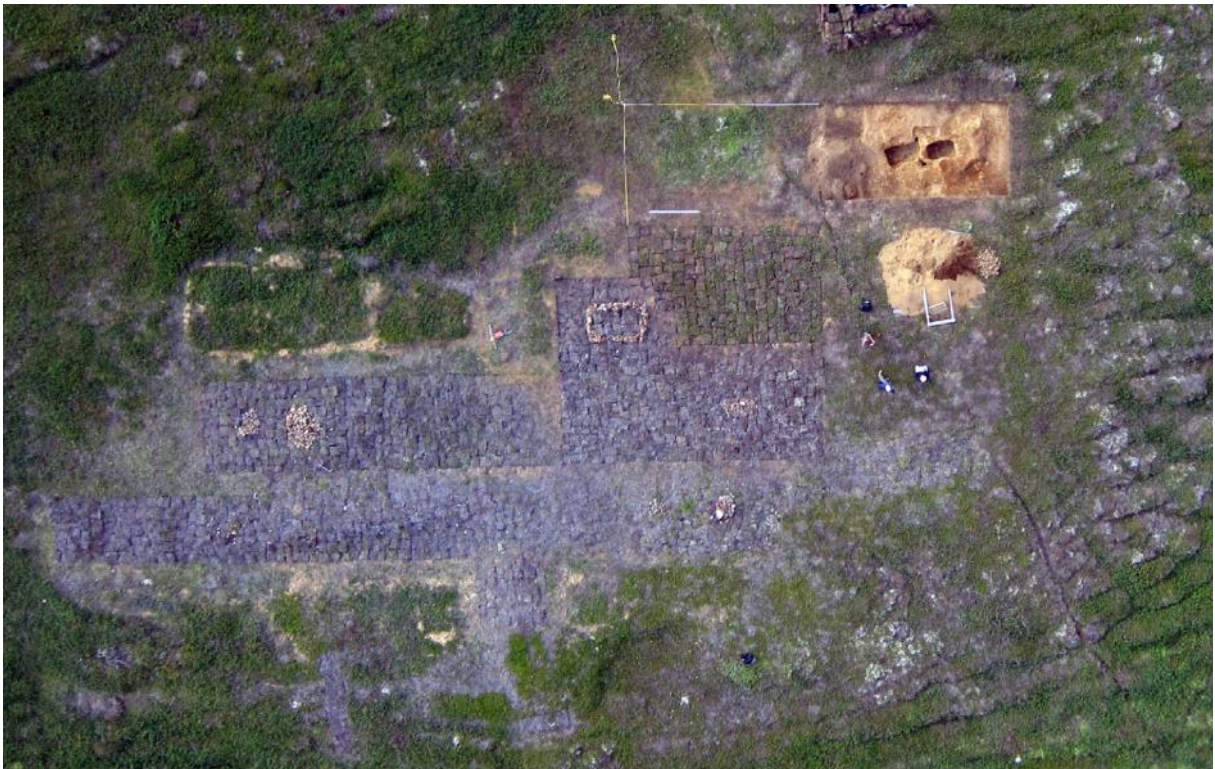
Mynd 1. Loftmynd af uppgriftarsvæði A og B – norður er til hægri. Svæði B er í efra hægra horni, og var 8 x 4 m. Búið var að moka ofan í svæði A þegar myndin var tekin, en sést vel því grænar þökurnar skera sig úr umhverfinu.

Area 2013_C - 3m 2 . Located south of Area B and west of Area A. This exploratory trench targeted a previously unobserved surface anomaly. No archaeological features or layers were discovered, although it is noted that the LNS tephra sequence was absent in this area, possibly due to truncation.