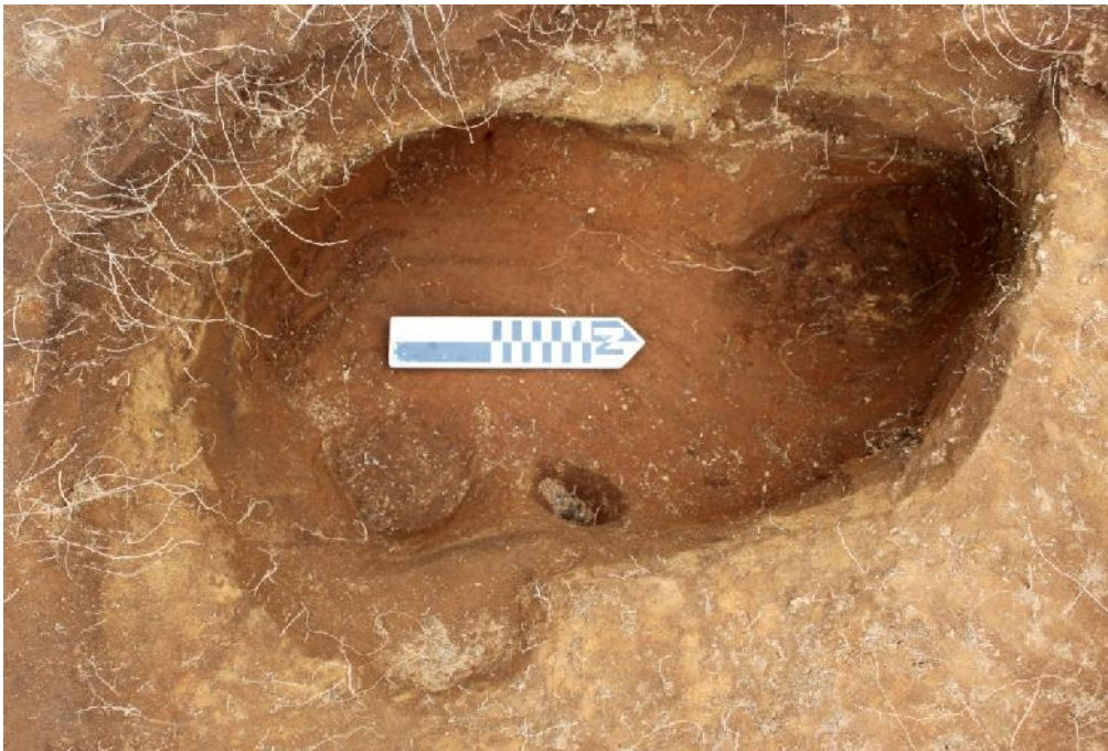
Mynd 3. Stór stoðarhola á svæði A, uppgráfin að hluta.